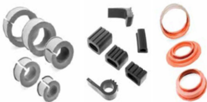
Insulation bushes / Sealing profiles / Bellows and HVAC ducts